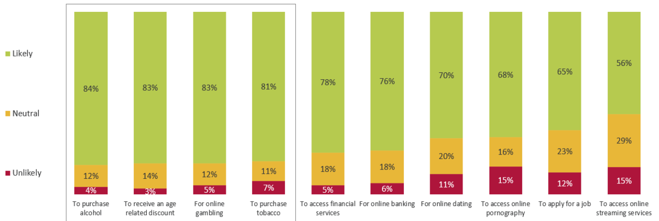
Figure 2. Likelihood (Net: 7-10) to agree to prove age for different online activities